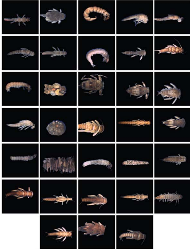
Figure 1: Oriented EPT29 Specimens. Caddisflies build and live in cases, so for some species this figure shows both the insect and the case (column 2, rows 3-5).